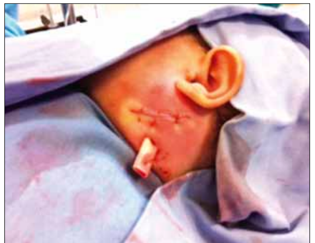
Figure 6 The little baby at the end of the surgery