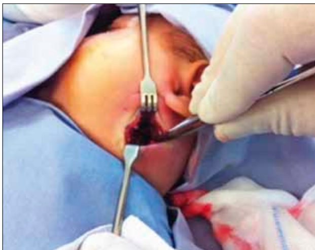
Figure 5 Intraoperative view