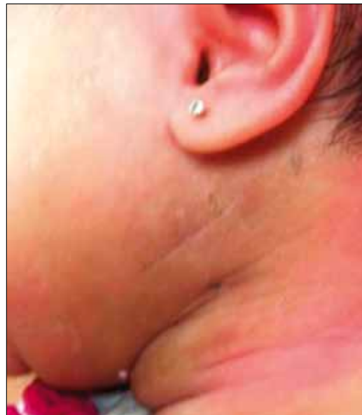
Figure 7 The little baby 2 weeks after the surgery

nately, sensitivity testing showed great sensitivity of the bacterium to the most common antibiotics (Figure 7).