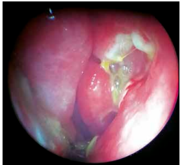
Figure 4 Verifying the permeability of the nasolacrimal stoma with fluorescein.

Over time, different types of material, such as organic, metallic or synthetic, have been used as a stent for the lacrimal punctum or for the lacrimal canalicular stenosis. The use of stents has been first described by Graue in 1932 (he used silver wire), followed by Henderson in 1950 (polyethylene) and Veir in 1962 (malleable metal rod) 2,6,7 . Since then, various materials such as silk, nylon or polypropylene have been frequently used. Over time, the design of stents has evolved, so