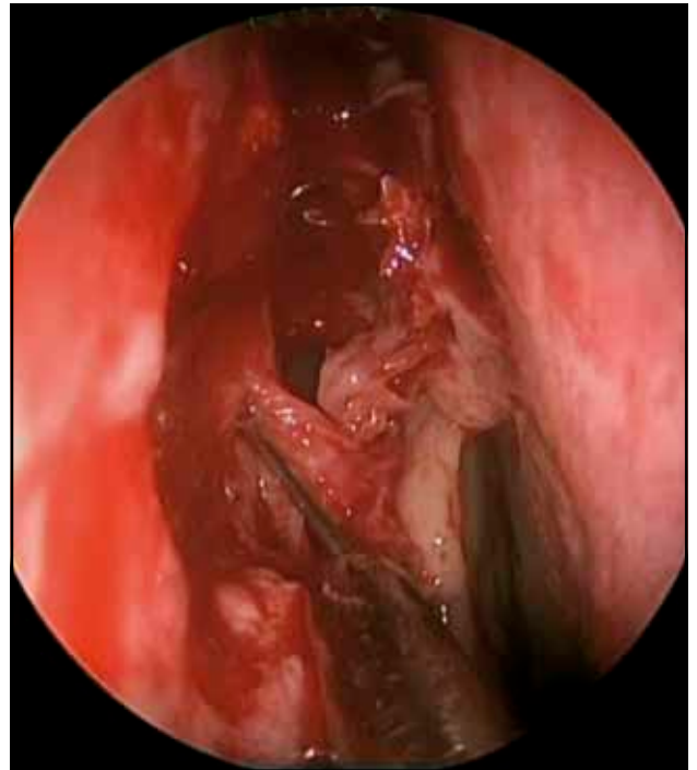
Figure 2. The distal end of the wire was inserted into the 3 mm suction tube while under endoscopic view.

the local ethic committee (2018/01), two groups of 20 patients who were operated between January 2012 and November 2017 were included into the study. For the patients included in Group A we used our new technique for the lacrimal stenting and for those in Group B one conventional method including retrieval device or forceps was performed. Both groups' operation videos were analysed by three otolaryngologists. The duration of retrieving the wire from the sac and out of the nasal passage, the number of mucosal lacerations, and bleeding were noted separately for both groups. Patients were followed for at least one year.