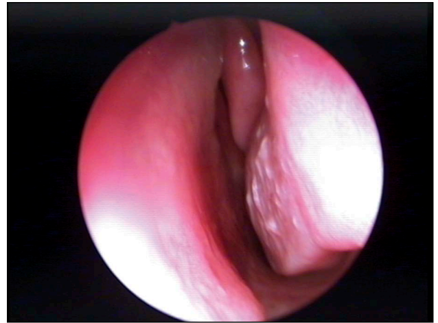
Figure 1 Hypertrophy of the inferior turbinate mucosa – nasal endoscopic examination

In chronic hypertrophic rhinitis (Figure 1), preoperative observations revealed severe metaplasia of the nasal epithelium, evident stratification in the epithelium and hyperplasia, degeneration of epithelial cells, loss of cilia and disruption of intercellular connections. Additionally, increased basilar membrane thickness, edema, nasal mucus overproduction and inflammatory infiltration in the lamina propria were observed. Increased number of goblet cells and submucosal glands was also found and the number of gland openings was increased 14 .