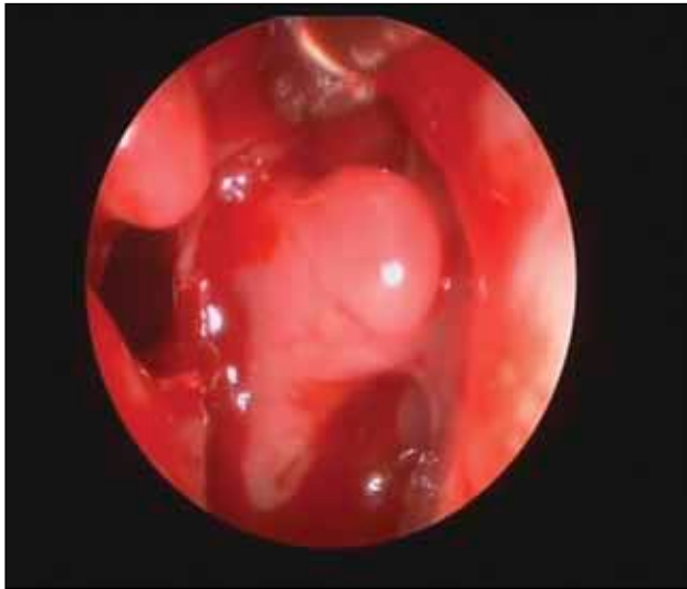
Figure 3 Surgical treatment - FESS