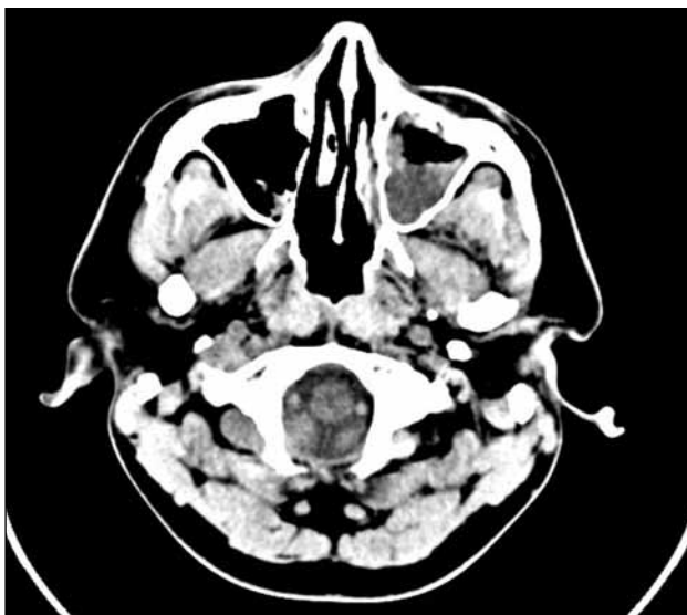
Figure 1 CT scan of the paranasal sinuses

To highlight the presence of biofilm in a wound, scientific evidence is needed, represented by microscopy visualization. A series of staining and molecular procedures include the staining for extracellular polymeric substances, like calcofluor white/ethidium bromide, Congo red/Ziehl carbol fuchsin, safranin/FITC-ConA, and DAPI/PAS. Peptide nucleic acid-fluorescence in situ hybridization is a molecular technique which can identify bacterial aggregates in host tissue 42-44 . Electron microscopy and confocal laser scanning microscopy represent the methods frequently used in previous studies. James et al. found that electron microscopy of biopsies from chronic wounds is significantly populated by dense bacterial aggregates (60% of the specimens) by comparison to fewer bacteria (6%) in the case of biopsies from acute wounds 45 . Those interpretations could clarify the prognosis for recalcitrant CRS or the different evolution in the case of chronic versus acute wound healing 42,44 . Hematoxylin and eosin staining is a cheap and handy method for detecting biofilms in CRS, that could predict the evolution after FESS (Figure 2).