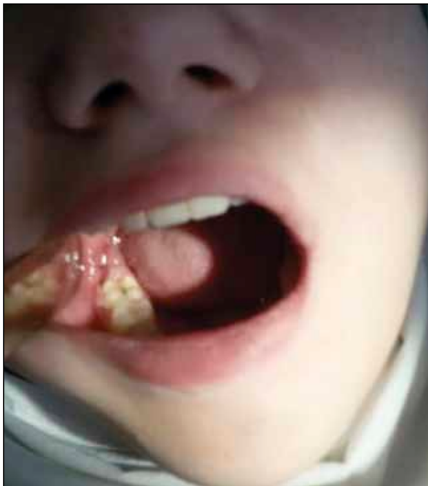
Figure 4 Seven-day follow-up