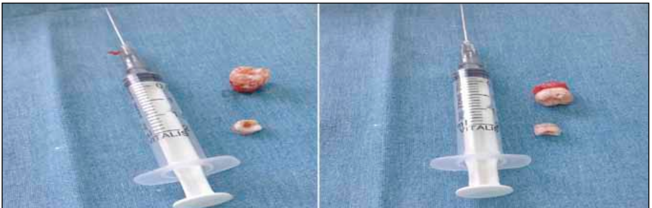
Figure 3 Operatory samples – the third and the fourth molar