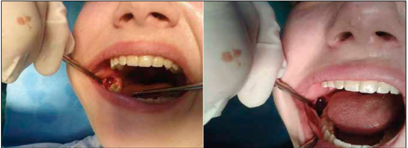
Figure 2 Intraoperative view - incision performed in the right retromolar space; trepanation of the mandibular cortical part revealing a cystic mass containing the crown of the 48th accessory tooth