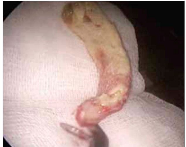
Figure 5 The aspect of the cotton pad (soaked with puss) after removal.