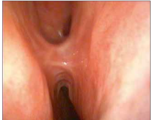
Figure 8 Endoscopic view - septo-turbinate synechiae on the left nasal fossa