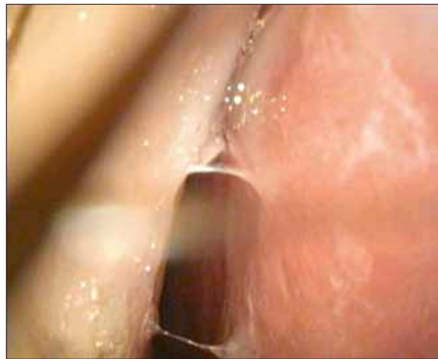
Figure 9 Right nostril: the angle formed by the crus lateralis and the nasal septum is narrowed, collapsing during inspiration.