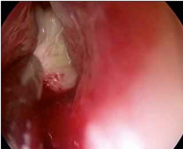
Figure 4 Endoscopic view of the right nasal fossa. The foreign body is located in the ethmoidal roof.