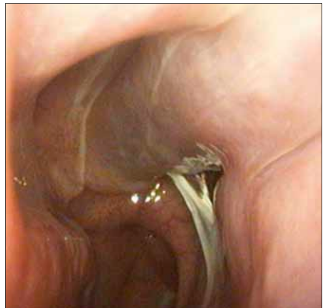
Figure 3 Endoscopic view of the right nasal cavity - persistent rhinorrhea after ESS – some ethmoidal cells have not been opened