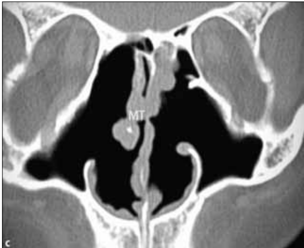
Figure 1 Cranio-facial CT-scan, coronal slice. Postoperative aspect of an ESS for chronic rhinosinusitis. Absence of both inferior turbinates and left middle turbinate, lack of ethmoidal cells, with a wide non-physiological opening of both maxillary sinuses.