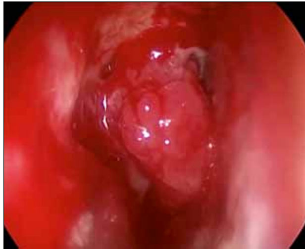
Figure 6 The aspect of the mucosa after the removal of the foreign body - local inflammation, friable mucosa, easily bleeding.

scopic examination we identified a cotton pad blocked in the ethmoidal roof. General anaesthesia was necessary in order to remove it (Figures 4-6).