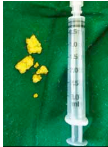
Figure 3 Foreign body removed with the "Visual hook"