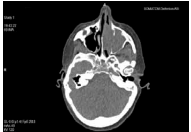
Figure 6 Cranio-facial CT aspect (axial slice).

Regarding postoperative epistaxis after excision of vascular tumors, it can be avoided if we have an optimal preoperative preparation (a good radiological assessment with angiography and selective embolization), a rigorous and accurate tumour dissection with careful haemostasis during surgery. Also, the anaesthesiologists have an important role, because they must control the blood pressure in terms of keeping low values during the surgery and to keep it from bouncing after the surgical act. From our point of view and based on the recent literature regarding epistaxis management, we consider that a complete and rigorous assessment based on clinical, paraclinical investigations (especially nasal endoscopic examination) and thorough patient history are the most important steps in order to establish the bleeding site and severity, the underlying cause and the appropriate treatment alternative. Concerning the treatment, we find the electrocauterization the best option for nasal bleeding ceasing (when there are no contraindications or technical impediments) due to its high success rate and low complications rate.