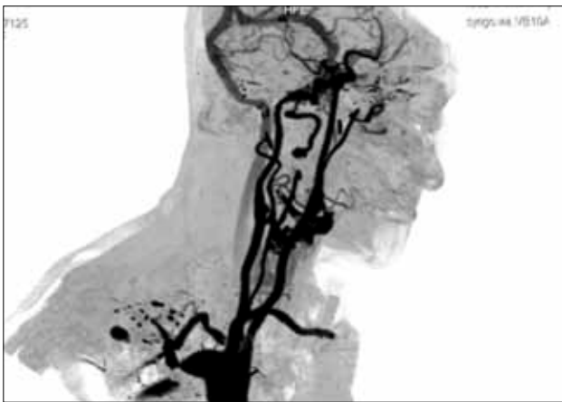
Figure 7 Angiography

ence or there are also unconcerned doctors who are superficial in patient approach.