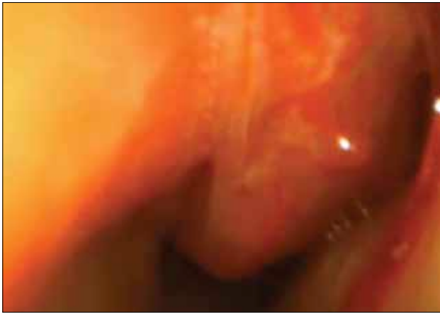
Figure 5 Endoscopic aspect - reddish, easily bleeding tumor of the left middle turbinate, in contact with the nasal septum.