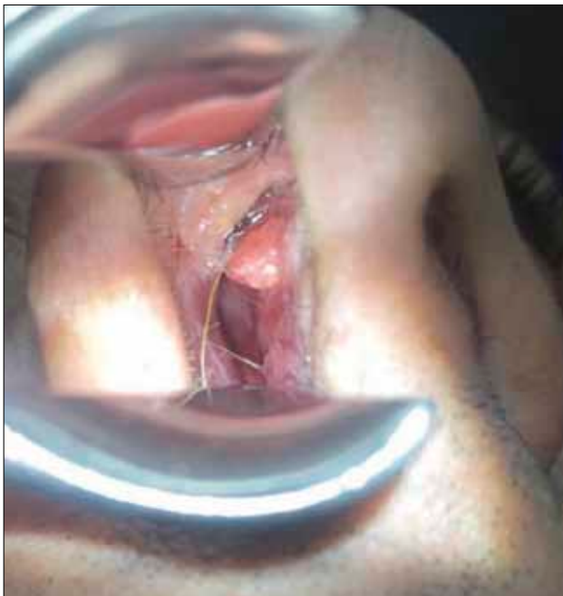
Figure 1 Nasal septum polyp (archive of ENT&HNS Department, "Sfanta Maria" Clinical Hospital).

Systemic causes 10 may include cardiovascular diseases (e.g. systemic arterial hypertension, atheromatosis and atherosclerosis), hematologic diseases (e.g. von Willebrand disease, hereditary hemorrhagic telangiectasia, vascular malformations 11 or haemophilia, para-haemophilia 12 ), hepatic disease 13 (cirrhosis and hepatic failure), endocrine causes (pregnancy, puberty or pheochromocytoma) and systemic medication (anticoagulants or NSAIDs).