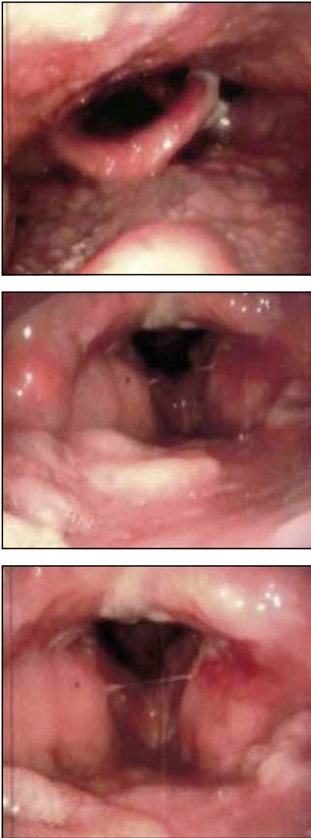
Figure 2. Laryngeal fibroscopy: bullous lesions and erosions on the surface of the pharyngeal-laryngeal mucosa and papillomatous lesions at the level of the vocal cords.

dysphagia. The patient was diagnosed at 10 months with recurrent juvenile laryngeal papillomatosis (genotype 6) – for which over time he was operated 87 times both in the pediatric ENT department and in the ENT Clinic of the “Sfanta Maria” Hospital, Bucharest. The patient received surgical treatment with cold instruments and CO 2 and Diode LASERs vaporization, but also non-specific antiviral therapy – Isoprinosine – and specific antiviral therapy – Cidofovir.