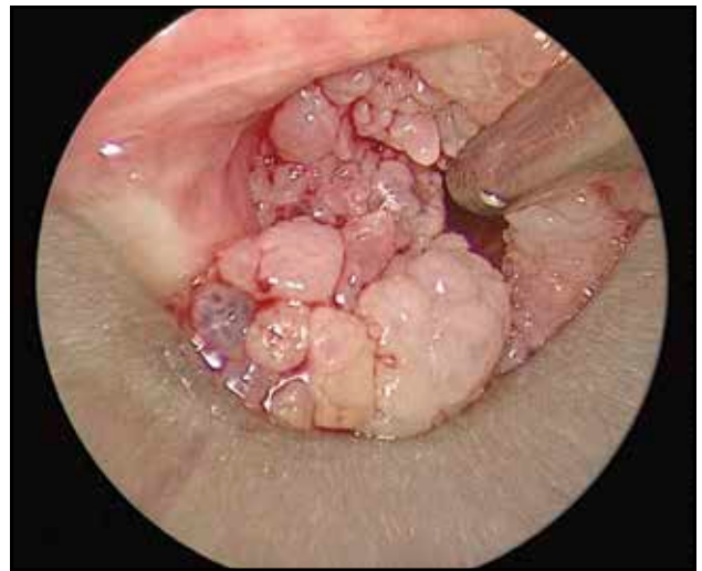
Figure 1. Suspension microlaryngoscopy – laryngeal papillomatosis.

The clinical picture in patients with laryngeal papillomatosis is characterized by dysphonia of varying degrees, dyspnea that can go up to acute respiratory failure due to an obstructive cause. Other less specific symptoms are: cough, recurrent pneumonia, insufficient growth, dysphagia or acute respiratory failure especially in children with acute respiratory infections. RRP may initially be confused with other disorders such as asthma, various allergies, croup,