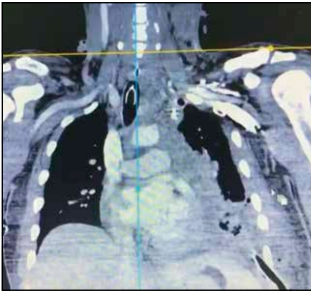
Figure 1. Contrast CT of the neck and chest (coronal slice) in one of our cases that was complicated by mediastinitis, in which the extension of the infection to the pleural space was evidenced; the patient died.