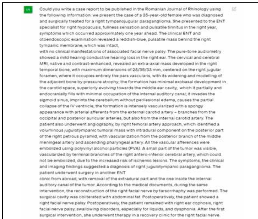
Figure 2. The original draft of the case report.

ChatGPT can generate data about a certain general subject, but it fails to present a full, detailed, accurate report of a given