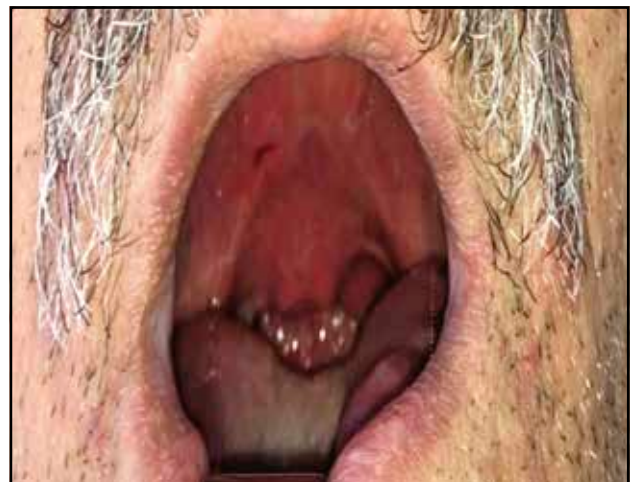
Figure 5. Postoperative aspect at 3 weeks after surgery (anterior palatoplasty and reduction of the uvula).

The study's outcome measures utilized subjective and objective methods to evaluate improvement. Subjective improvement in daytime sleepiness was quantified using the ESS. Objectively, the efficacy of the AP was evaluated by analyzing the changes in the polysomnographic data. This objective data was instrumental in assessing the physiological improvements in sleep patterns and breathing, offering a scientific basis to deter-