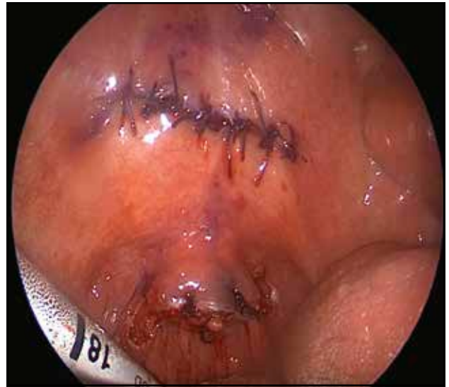
Figure 4. Final view of anterior palatoplasty, uvula reduction and posterior tonsillar pillars vaporization (intraoperative view).

Also, all patients were advised to follow a diet of