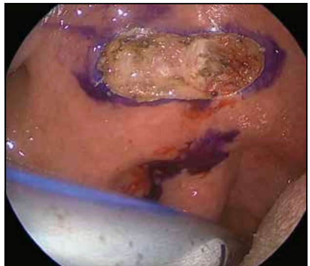
Figure 2. Horizontal rectangular strip of mucosa was removed – intraoperative view.