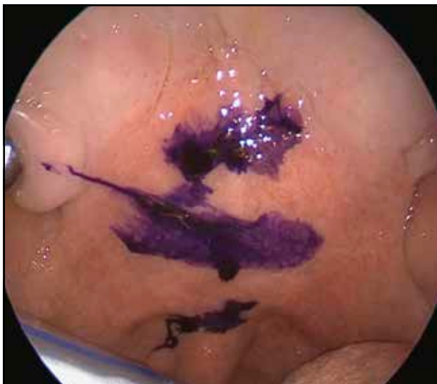
Figure 1. Anterior palatoplasty intraoperative picture – palatine veil marked.

Patients were evaluated with one night polysomnography and completed also ESS before the surgery.