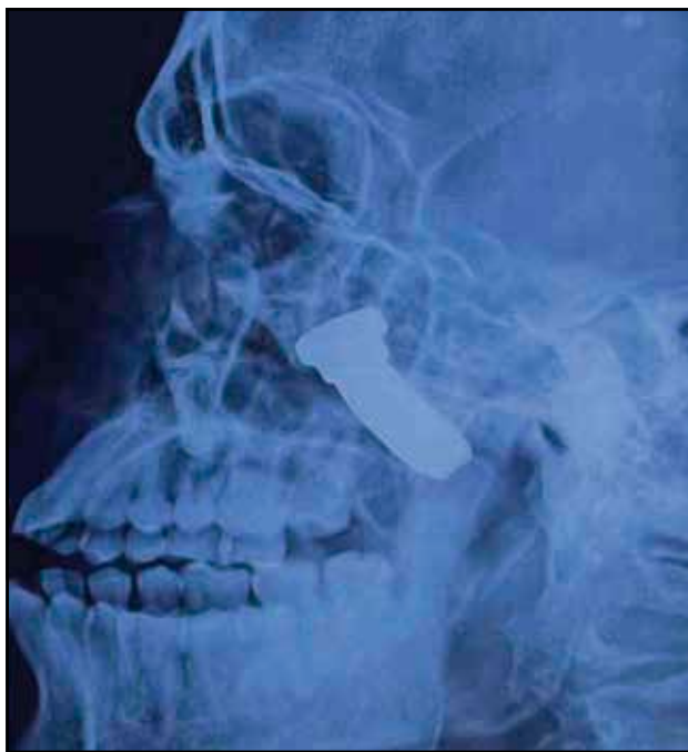
Figure 2. X-ray of the nose and paranasal sinuses (lateral view) showing an abnormal curved radio-opaque shadow near the posterior wall of the left maxillary sinus.

On examination, there was a sutured laceration of 5 cm in the region of the left nasolabial fold, extending superiorly till 1.5 cm below the lower lid (Figure 1A). There was conjunctival congestion with corneal rupture and entrap-