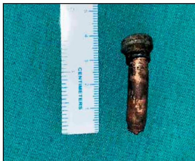
Figure 5. Mettallic refrigerator pipe of 4 cm long.

in the entry wound. The wound was closed in layers using 3.0 vicryl and 3.0 Ethilon.