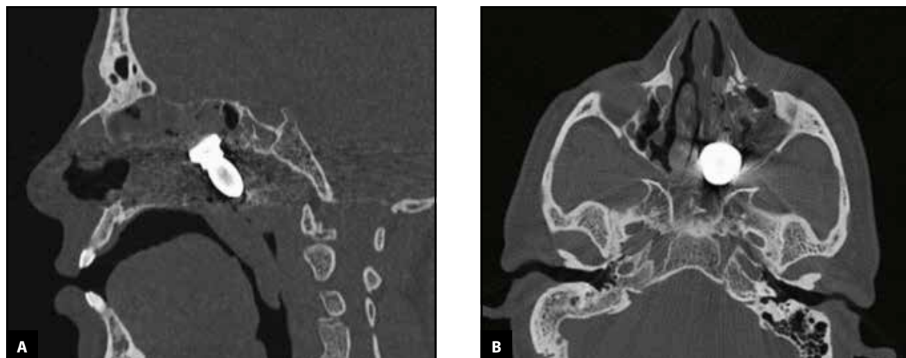
Figure 3. Cranio-facial CT scan – sagittal (A), axial (B) – showing a big dense foreign body in the posterior wall of the left maxillary sinus reaching up to the left sphenoid sinus, a ruptured left globe, a fracture of the left inferior orbital wall, and fat herniation from the same aperture.